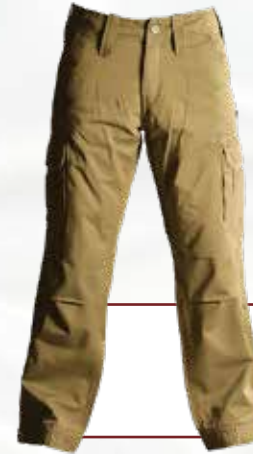
CARGO & REGULAR TROUSERS