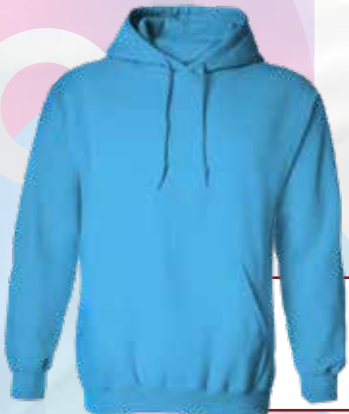
JACKETS / HOODIES